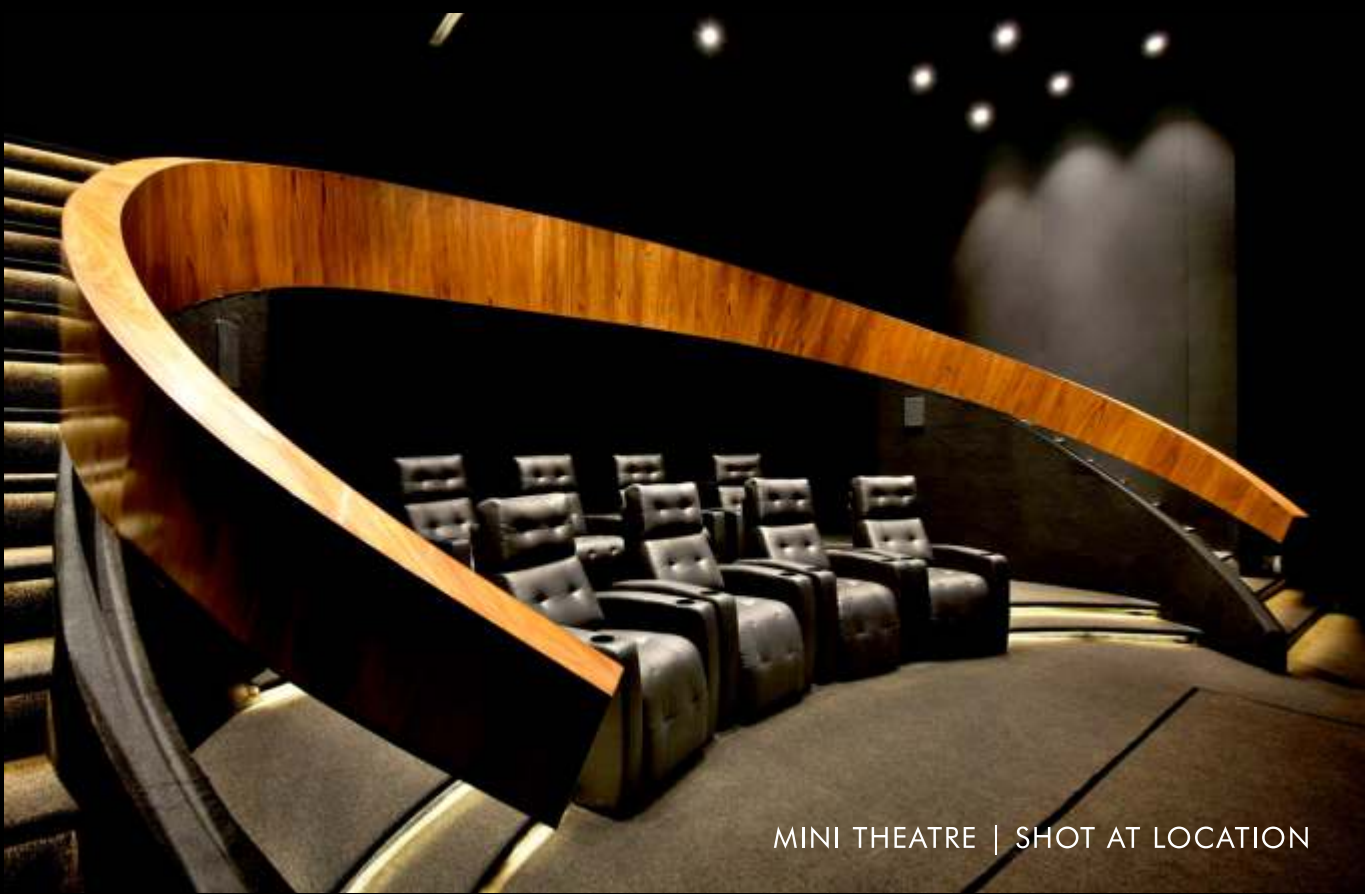
MINI THEATRE | SHOT AT LOCATION