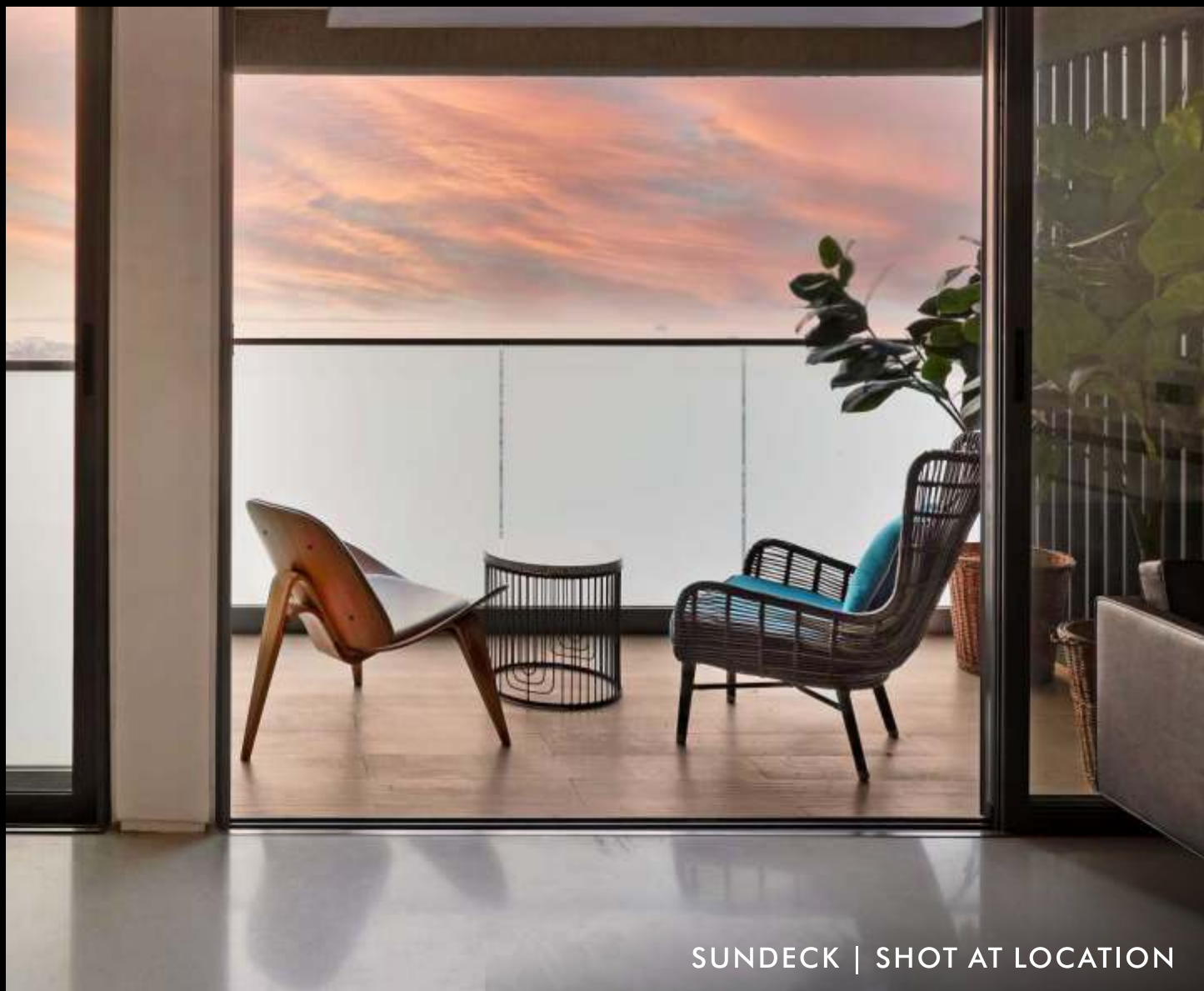
SUNDECK | SHOT AT LOCATION

Even more so in one of the city's most coveted neighbourhoods – Khar West.