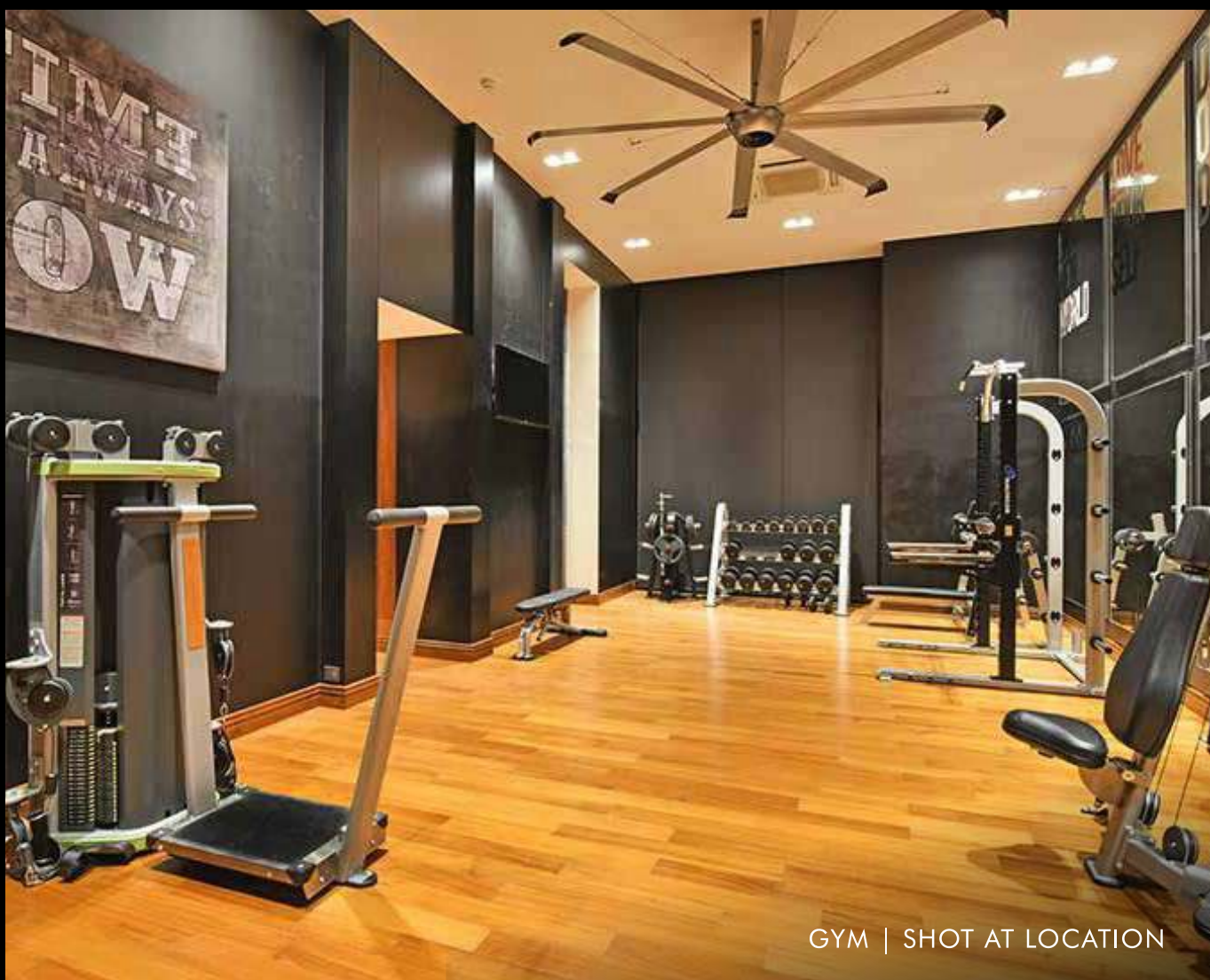
GYM | SHOT AT LOCATION

There is no urgency to sell your current property.